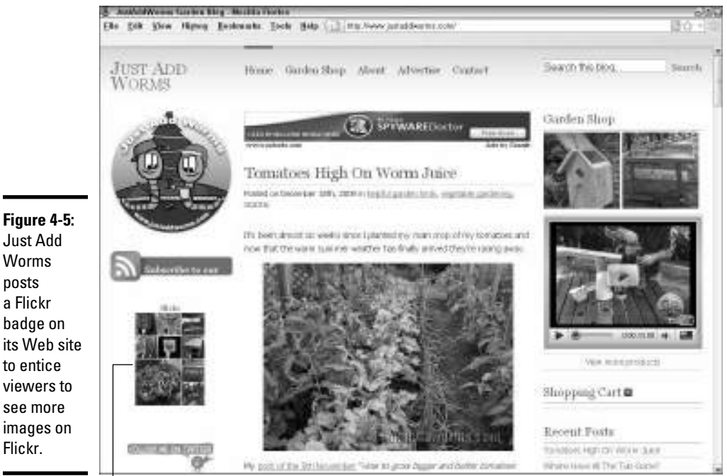
Figure 4-5 shows the Flickr badge for the Just Add Worms site (www. justaddworms.com). This Flash-driven version of a badge, in which rotating images are randomly enlarged, links to the Just Add Worms photostream page on Flickr (www.flickr.com/photos/justaddworms).

A Flickr badge on your Web site or other social media pages acts like a banner ad. The badge links to one of your Flickr pages. Flickr has an easy widget to create badges at www.flickr.com/badge.gne, or you can use a third-party badge builder. Select a static HTML graphic or a Flash-driven badge, with your choice of photos and layouts. The badge acts as a teaser to your Flickr site, particularly because it can present multiple images at a time.